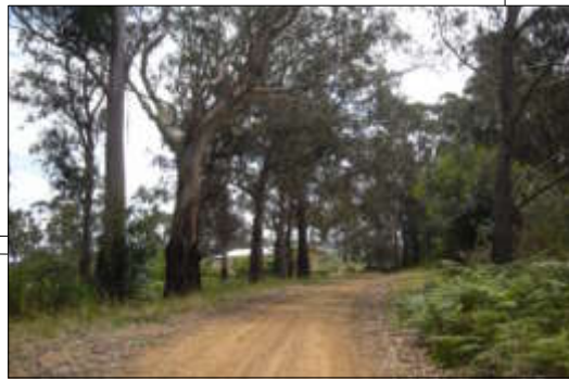
Brassey St would make an ideal component of the trail route getting into Elleker.