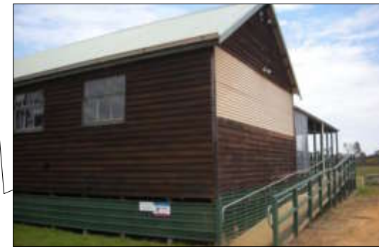
The Elleker Hall would be the logical trailhead at the eastern end of the proposed rail-trail