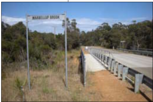
The original railway bridge over Marbellup Brook is now missing. This pedestrian/cyclists bridge will make an ideal replacement bridge for crossing the creek