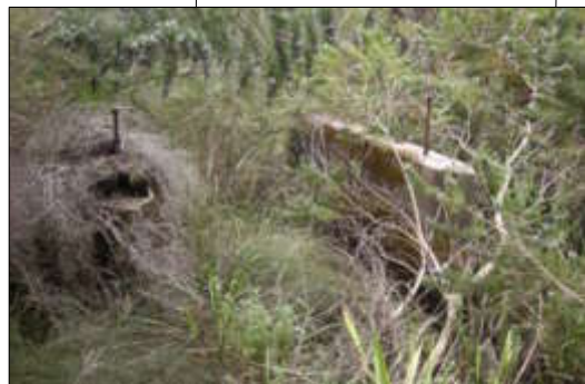
Several old bridges will need to be re-decked, with handrails, as part of the trail development