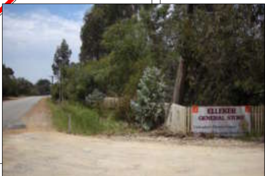
A short spur path is recommended from the proposed rail-trail route to the Elleker Store