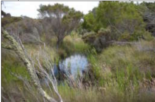
Timber culverts that once spanned these creeks will need to be replaced with short boardwalks