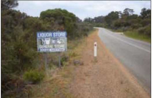
The proposed crossing point of Lower Denmark Road is located where sight lines are best