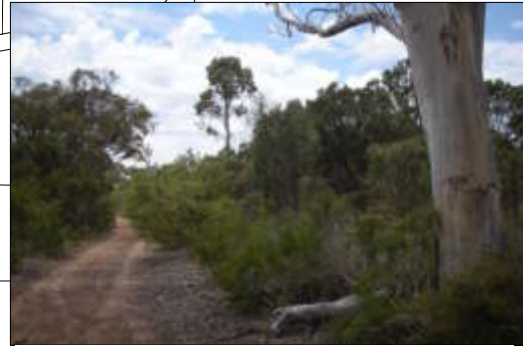
This gravel track could be used by cyclists and horse riders, while walkers use the Nature Trail