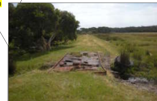
The unconstructed part of Wilgie Road (the original railway formation) could become part of the trail route.