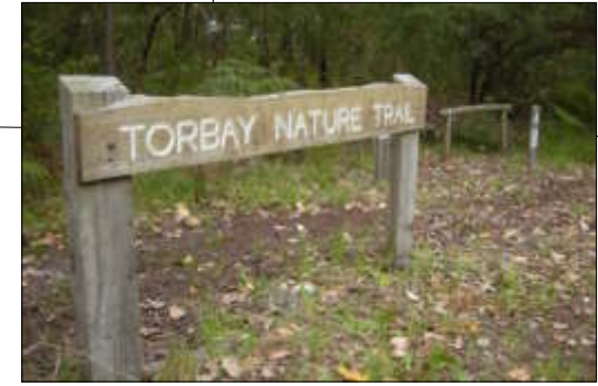
Torbay Nature Trail uses part of the original railway formation