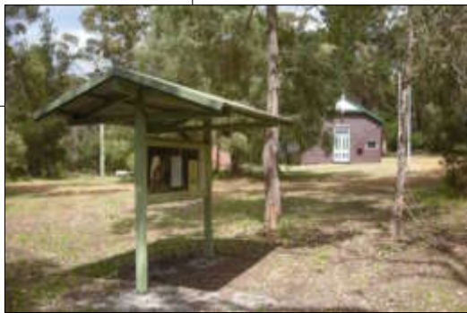
The Torbay Hall and surrounds provide an ideal trailhead at the western end of the proposed rail-trail